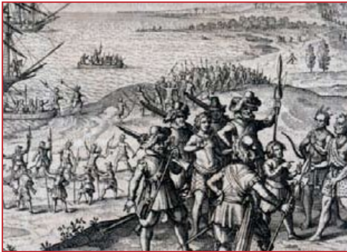
Pocahontas visited by her brothers, Theodor de Bry

Word was that the Spanish had found “mountains of gold” in this new land, so these voyagers were intent on finding riches as well as a sea route to Asia. Little did the settlers know as they disembarked on this spring day, May 14, 1607, how many and what kinds of hardships they would face as they set out to fulfill their dreams of riches and adventure in Virginia.