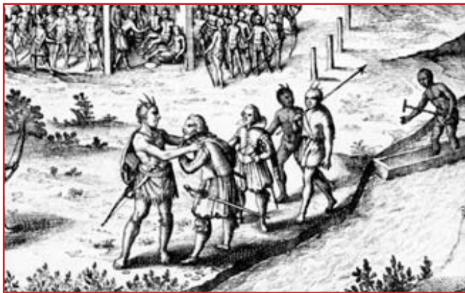
Engraved by Theodor de Bry

Englishmen were very aware of the importance of women and families in the success of Jamestown. In 1619, while receiving grants of land from the Virginia Company as dividends for their time in Virginia, the male