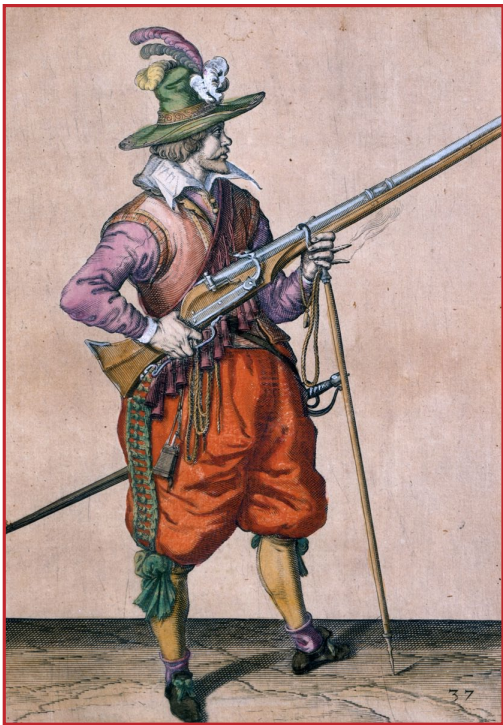
Engraving by Jacques de Gheyn