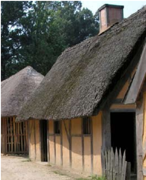
English housing inside re-created James fort, Jamestown Settlement

A week after the building of the second fort, Captain Newport sailed for England and the realities of life in the wilderness set in as colonists experienced a variety of challenges including hunger and disease, each of which took a heavy toll. The colonists were so weakened from sickness it was reported they could hardly stand. George Percy wrote that most died from famine, but the major killer was more likely polluted river water, full of “slime and filth,” which led to salt poisoning, dysentery and typhoid. An epidemic swept the settlement and left half the 104 men and boys dead before the end of September. Only about 50 survived as winter approached. The colony was on the brink of collapse. With Captain Newport gone and Captain Gosnold having died, the leadership disintegrated, and the men began quarreling among themselves. It was around this time that the Powhatan, rather than resuming hostilities against the weakened, disease-ridden Englishmen, instead brought food to the fort and saved the colonists’ lives.