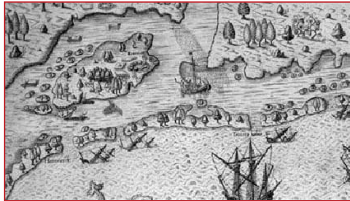
Arrival of the English, Theodor de Bry

In May of 1607, three small ships – the Discovery, Godspeed and Susan Constant – landed at what we know today as Jamestown. On board were 104 men and boys, plus crew members, who had left England on a bitter cold December day. Sailing down the Thames River with little fanfare, they were unnoticed by all but a few curious onlookers. The ships were packed with supplies they thought would be most needed in this new land. Sponsors of the voyage hoped the venture would become an economic prize for England. An earlier undertaking in the 1580s on Roanoke Island, in what is now North Carolina, had failed, but times had changed. England had signed a peace treaty with Spain, and was now looking westward to establish colonies along the northeastern seaboard of North America.