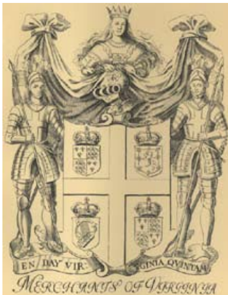
Coat of Arms of London Company

From the beginning when the Virginia Company of London was formed, the overseas venture was an economic one. Captain Newport led the efforts of the settlers to discover gold ore even when their efforts might have been better used toward acquiring food. They were not quick to learn how to grow food in their new environment and increasingly had to rely upon the Indians for corn and other crops. In addition, the colonists did not have the tools they needed since they were limited in what they could bring from England. Lumber was a resource that was plentiful in Virginia, and the location of Jamestown along the water where ships could dock should have been ideal for this industry. Yet, lumber turned out to be a very expensive commodity to ship. Wood extractives such as pitch and tar, soapash and potash were more practical but needed processing before shipping. Silk production, glassmaking and wine production were all industries which were attempted with varying degrees of success, yet none to the extent needed to make a profit for the Virginia Company. Within a few years, most of these early attempts, with the exception of lumber products, were abandoned. Settlers continued to barter with the Indians, as they had from the beginning, in order to meet their daily needs. Even the fur trade, which made a small profit for the Company, would not become a very successful venture until after 1630.