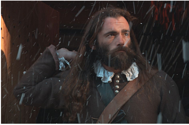
John Smith, from 1607: A Nation Takes Root. Jamestown Settlement