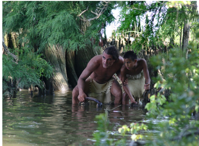
Powhatan Indians observe English arrival, from 1607: A Nation Takes Root. Jamestown Settlement

The climate encountered by the English differed slightly