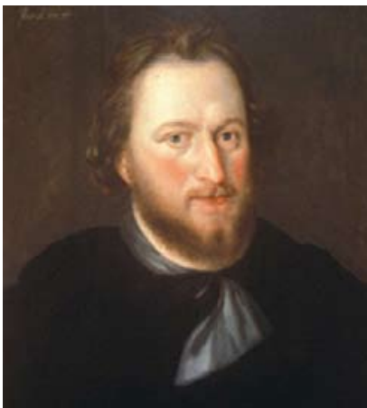
Thomas West, Third Baron de la Warr

Services were held fourteen times a week, with sermons preached at services on Sunday and on either Wednesday or Thursday. Two prayer services, one in the morning and one in the evening, were held Monday through Saturday. An afternoon catechism was also held by the minister on Sunday. After the introduction of Martial Law in 1610, attendance was required at all services with punishments for violators ranging from loss of food rations to execution.