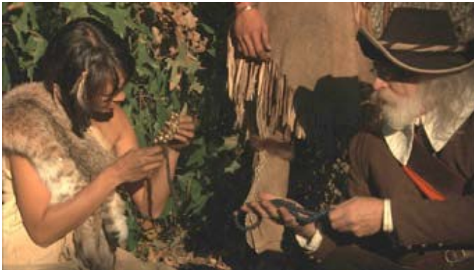
Powhatan trade with English, from 1607: A Nation Takes Root . Jamestown Settlement