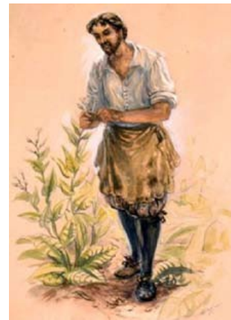
John Rolfe, Sidney King

lish tastes than the bitter Indian variety. He not only learned how to raise this new type of plant but also managed to harvest and cure it so it could be transported to England without spoiling. After a couple of years, he met with great success and was busily marketing his crop among English merchants and tobacco sellers when he traveled with his bride, Rebecca, to London in 1616. Ironically, he could not smoke a pipe in the presence of King James I as the king's vehement opposition to tobacco was well-known at court and had been set out at length in his A Counter-Blaste to Tobacco published in 1604, in which he attacked arguments in favor of smoking and derided claims about its medicinal qualities. He called it a "stinking weed," and "a custom loathsome to the eye, hateful to the nose, harmful to the brain, dangerous to the lungs..." Nevertheless, tobacco revolutionized the colony's economy and became the cash crop of Virginia.