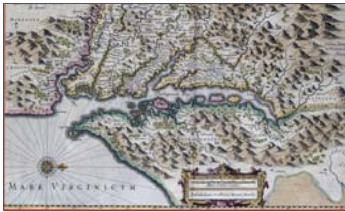
Hondius' Map of Virginia, circa 1630

carpenters, a tailor, a barber and two surgeons. The rest of the company was made up of unskilled workers of various kinds including common seamen, laborers and four boys.