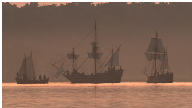
Exploring Virginia waters, from 1607: A Nation Takes Root. Jamestown Settlement

On the morning of April 26, they spotted the capes around the entrance to the Chesapeake Bay, a body of salt water fed by the Atlantic Ocean that meets fresh water from four rivers. The English named these rivers the Potomac, Rappahannock, York and James. These tributaries are tidal estuaries with tides being felt 75-100 miles upstream. Before heading to the interior, and ultimately finding the marsh-rimmed peninsula where they would dock their ships, Captain Newport placed a cross at the entrance of the Bay, establishing Protestant Christianity in the New World, and gave the cape its name, Cape Henry, after the king's eldest son, Prince Henry.