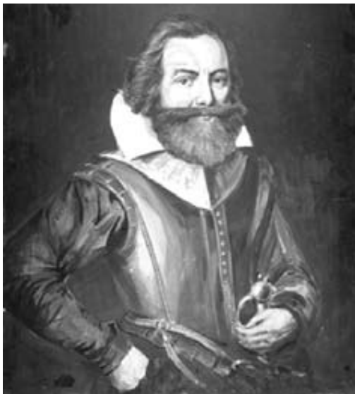
Captain John Smith

Captain Christopher Newport, the expedition's most experienced mariner, commanded the largest of the three ships, the Susan Constant . Bartholomew Gosnold commanded the Godspeed , and John Ratcliffe captained the smallest ship, the Discovery . Also among the crew was another man who would acquire his own recognition in this new land, Captain John Smith. Smith had earned fame on the battlefields of Europe but feuded constantly with those who were in command on this voyage and arrived at Jamestown having been restrained as a prisoner while on board the Susan Constant . In addition to strong disagreements which bordered on mutiny, the men aboard the three small ships suffered through a terrible storm which caused the mariners to lose their bearings for a few days.