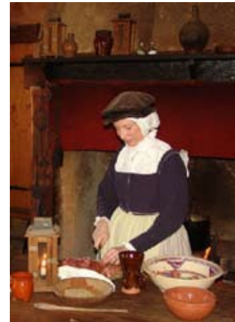
Cooking in re-created James fort, Jamestown Settlement

women six to one. Rather than serve the Virginia Company as indentured servants, they probably worked as seamstresses and laundresses. There may have been hundreds of "diverse others" who braved the crossing only to perish in the harsh conditions at Jamestown. In the fall of 1618, it was reported that the City of London was shipping 100 boys and girls to Virginia. These children were destitute, supported by London parishes, and the relocation seemed an ideal arrangement for all parties concerned. Even though many of the children did not want to go, it was deemed best for them because they were being rescued from the streets and given an opportunity to learn some good crafts or trades. Around 250 destitute children were transported between 1617 and 1623 to the Virginia colony. Because there is only an occasional reference to children at Jamestown, very little is known about their daily lives.