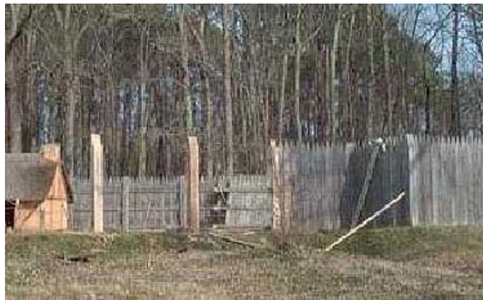
Building the re-created James fort, Jamestown Settlement

The instructions for the colonists had been to locate a site which would be far enough from the coast to avoid being surprised by Spanish warships, a major concern of the Virginia Council. In May 1607, upon selecting the site they named Jamestown in honor of their King, they noted the channel was deep enough to tie their ships to the trees on the shore. This was an important consideration, saving time and effort in loading ships for transport of goods to England. They also felt it could be easily defended against local Indians should they prove hostile. The Powhatan Indians were wary of the Englishmen from their first sighting. According to John Smith, some of the Indians welcomed them hospitably, offering food and entertainment, while others discharged their arrows and then retreated as the colonists fired their guns.