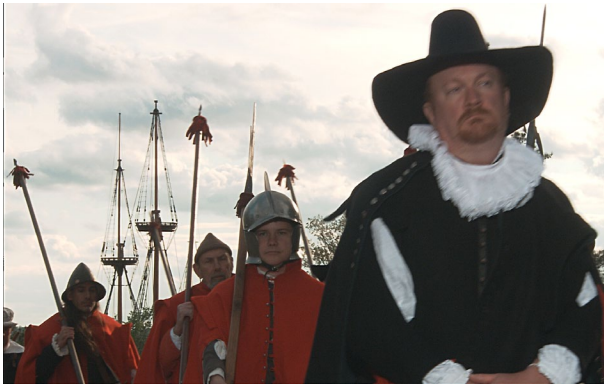
Lord de la Warr arrives, from 1607: A Nation Takes Root. Jamestown Settlement

and mapping of the Chesapeake Bay area. Smith's tenure as president lasted about a year. In October 1609, he was forced to return to England due to a gunpowder injury, and the colony again began to deteriorate.