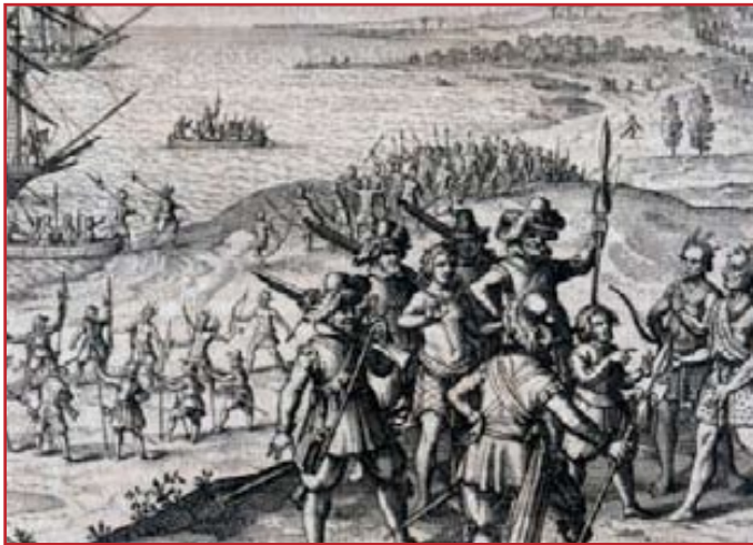
Pocahontas visited by her brothers, Theodor de Bry

Word was that the Spanish had found “mountains of gold” in this new land, so these voyagers were intent on finding riches as well as a sea route to Asia. Little did the settlers know as they disembarked on this spring day, May 14, 1607, how many and what kinds of hardships they would face as they set out to fulfill their dreams of riches and adventure in Virginia.