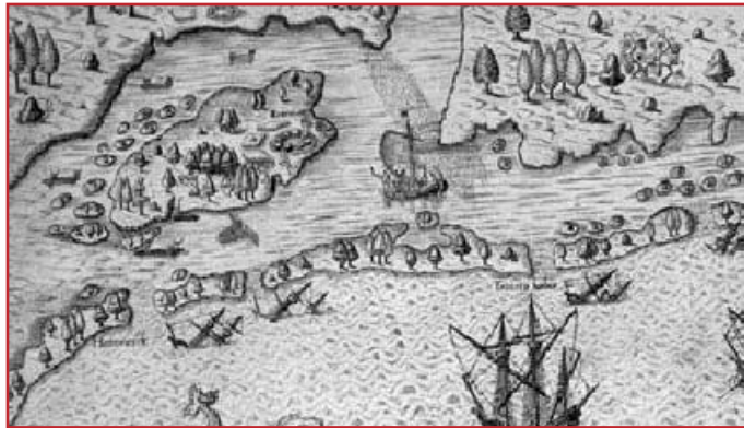
Arrival of the English, Theodor de Bry

In May of 1607, three small ships – the Discovery, Godspeed and Susan Constant – landed at what we know today as Jamestown. On board were 104 men and boys, plus crew members, who had left England on a bitter cold December day. Sailing down the Thames River with little fanfare, they were unnoticed by all but a few curious onlookers. The ships were packed with supplies they thought would be most needed in this new land. Sponsors of the voyage hoped the venture would become an economic prize for England. An earlier undertaking in the 1580s on Roanoke Island, in what is now North Carolina, had failed, but times had changed. England had signed a peace treaty with Spain, and was now looking westward to establish colonies along the northeastern seaboard of North America.