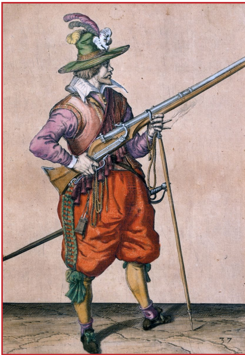
Engraving by Jacques de Gheyn