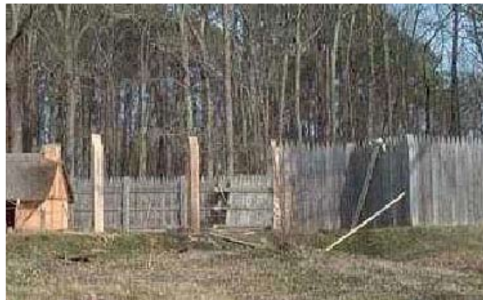
Building the re-created James fort, Jamestown Settlement

The instructions for the colonists had been to locate a site which would be far enough from the coast to avoid being surprised by Spanish warships, a major concern of the Virginia Council. In May 1607, upon selecting the site they named Jamestown in honor of their King, they noted the channel was deep enough to tie their ships to the trees on the shore. This was an important consideration, saving time and effort in loading ships for transport of goods to England. They also felt it could be easily defended against local Indians should they prove hostile. The Powhatan Indians were wary of the Englishmen from their first sighting. According to John Smith, some of the Indians welcomed them hospitably, offering food and entertainment, while others discharged their arrows and then retreated as the colonists fired their guns.