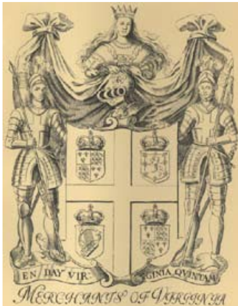
Coat of Arms of London Company

From the beginning when the Virginia Company of London was formed, the overseas venture was an economic one. Captain Newport led the efforts of the settlers to discover gold ore even when their efforts might have been better used toward acquiring food. They were not quick to learn how to grow food in their new environment and increasingly had to rely upon the Indians for corn and other crops. In addition, the colonists did not have the tools they needed since they were limited in what they could bring from England. Lumber was a resource that was plentiful in Virginia, and the location of Jamestown along the water where ships could dock should have been ideal for this industry. Yet, lumber turned out to be a very expensive commodity to ship. Wood extractives such as pitch and tar, soapash and potash were more practical but needed processing before shipping. Silk production, glassmaking and wine production were all industries which were attempted with varying degrees of success, yet none to the extent needed to make a profit for the Virginia Company. Within a few years, most of these early attempts, with the exception of lumber products, were abandoned. Settlers continued to barter with the Indians, as they had from the beginning, in order to meet their daily needs. Even the fur trade, which made a small profit for the Company, would not become a very successful venture until after 1630.