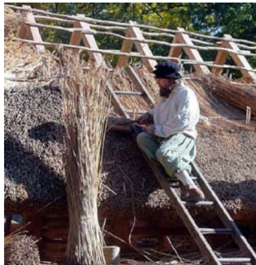
Thatching a roof in re-created James fort, Jamestown Settlement

In May 1611, a new lieutenant governor, Sir Thomas Dale, arrived in Virginia with a fleet bearing 300 new settlers and soldiers as well as provisions, supplies, livestock and seeds to grow garden crops. These new supplies and the leadership of Dale seemed to rejuvenate the town. Dale was a military man who was appalled at the conditions he found at Jamestown. Within a month of his arrival, he toughened and