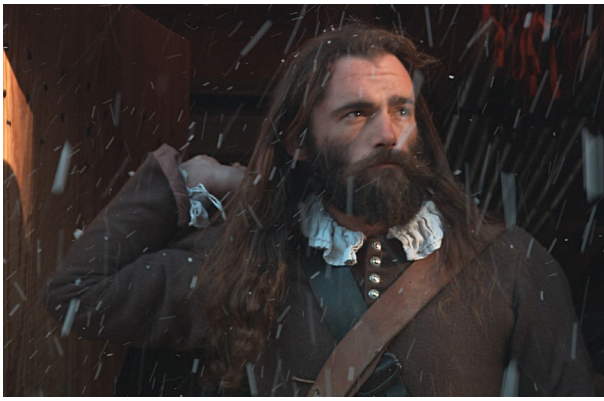
John Smith, from 1607: A Nation Takes Root. Jamestown Settlement