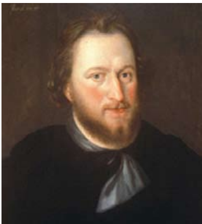
Thomas West, Third Baron de la Warr

Services were held fourteen times a week, with sermons preached at services on Sunday and on either Wednesday or Thursday. Two prayer services, one in the morning and one in the evening, were held Monday through Saturday. An afternoon catechism was also held by the minister on Sunday. After the introduction of Martial Law in 1610, attendance was required at all services with punishments for violators ranging from loss of food rations to execution.