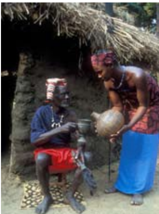
West African village life

There were many similarities between the societies of Kongo / Angolan and the Powhatan. Women were in charge of raising crops, and men were hunters. Unlike the Powhatan Indians, some men in Kongo/Angola may have had experience tending cattle, goats, chickens and guinea fowl. They also produced iron tools and weapons. The people of Kongo/Angola wove cloth from materials such as tree bark, palm and cotton. This cloth was used for decorative purposes, as well as for clothing. Like English and Powhatan fashions, dress was one way that Africans could communicate status and social role to one another.