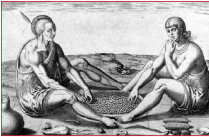
Their sitting at meat, Theodor de Bry

from the climate we know in Virginia today, because in 1607 the northern hemisphere was experiencing a slightly cooler period known as the “Little Ice Age.” Winters were more severe and had fewer frost-free days per year in which to cultivate crops. Even so, there were many plants and roots available for gathering, and rich soil made cultivation of crops possible. The Powhatan lifestyle was heavily dependent upon a seasonal cycle. Their planting, hunting, fishing and gathering followed the rhythm of the seasons. They raised vegetables, such as corn, beans and squash, with corn being the most important. They ate fresh vegetables in the summer and fall, and fish, berries, and stored nuts in the spring. Fishing was a