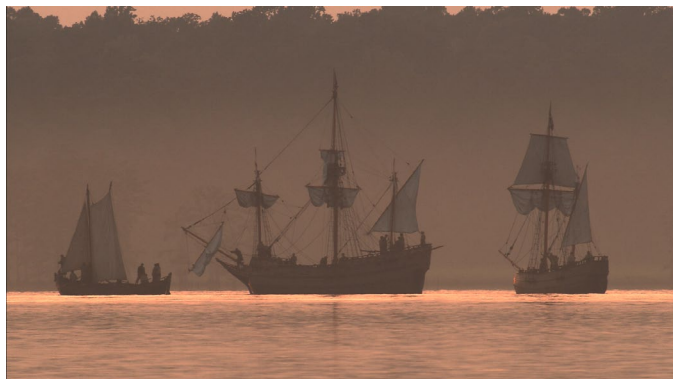
Exploring Virginia waters, from 1607: A Nation Takes Root. Jamestown Settlement

On the morning of April 26, they spotted the capes around the entrance to the Chesapeake Bay, a body of salt water fed by the Atlantic Ocean that meets fresh water from four rivers. The English named these rivers the Potomac, Rapahannock, York and James. These tributaries are tidal estuaries with tides being felt 75-100 miles upstream. Before heading to the interior, and ultimately finding the marsh-rimmed peninsula where they would dock their ships, Captain Newport placed a cross at the entrance of the Bay, establishing Protestant Christianity in the New World, and gave the cape its name, Cape Henry, after the king's eldest son, Prince Henry.