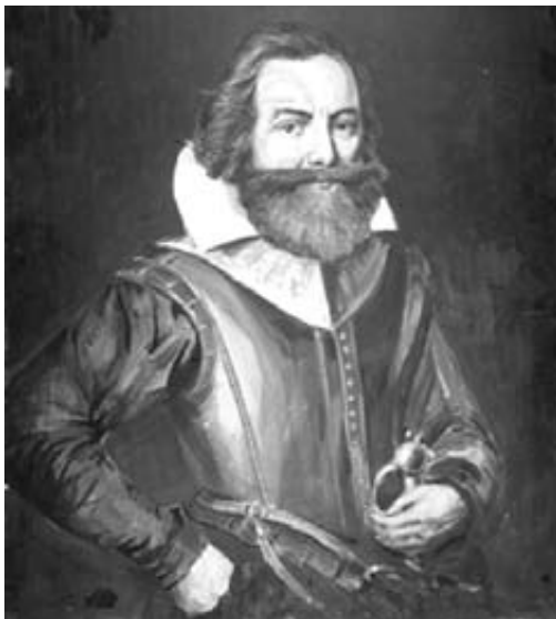
Captain John Smith

Captain Christopher Newport, the expedition's most experienced mariner, commanded the largest of the three ships, the Susan Constant . Bartholomew Gosnold commanded the Godspeed , and John Ratcliffe captained the smallest ship, the Discovery . Also among the crew was another man who would acquire his own recognition in this new land, Captain John Smith. Smith had earned fame on the battlefields of Europe but feuded constantly with those who were in command on this voyage and arrived at Jamestown having been restrained as a prisoner while on board the Susan Constant . In addition to strong disagreements which bordered on mutiny, the men aboard the three small ships suffered through a terrible storm which caused the mariners to lose their bearings for a few days.