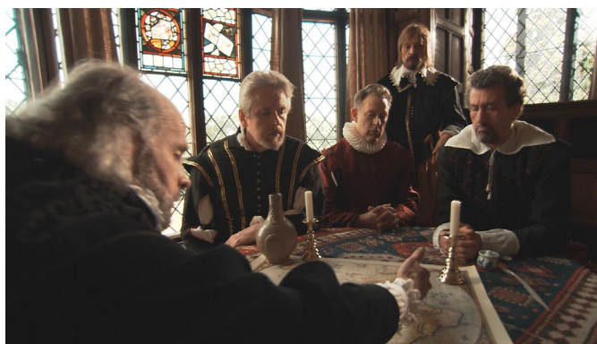
Virginia Company of London, from 1607: A Nation Takes Root . Jamestown Settlement

A little over a third of the newly-arrived settlers were described as "gentlemen." These men were from among the gentry in England and had been recruited by some of the financial backers of the enterprise. Many of the first colonists had military experience several were ex-soldiers and privateers who had fought against the Spanish or in the Irish wars. The leaders of the Virginia Company sent men with military background because of the potential threat of conflict with the Spanish and the native Powhatan Indians. Among the non-gentry were a minister and a dozen skilled craftsmen and artisans – a blacksmith, a mason, two bricklayers, four