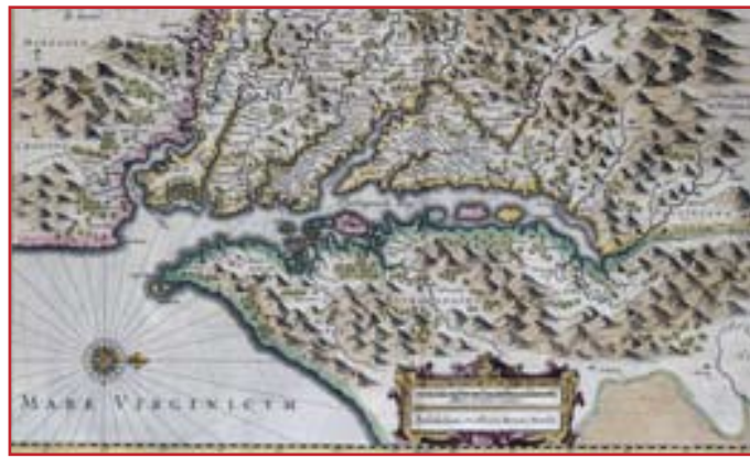
Hondius' Map of Virginia, circa 1630

carpenters, a tailor, a barber and two surgeons. The rest of the company was made up of unskilled workers of various kinds including common seamen, laborers and four boys.