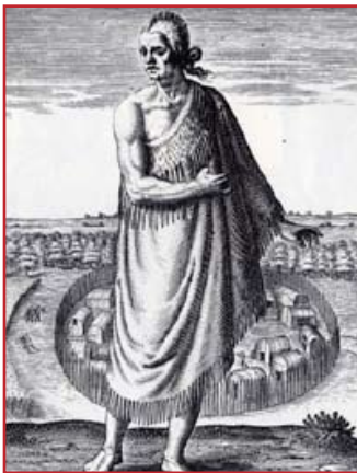
Aged man, Theodor de Bry

The Powhatan people were tribes or nations of Eastern Woodland Indians who occupied the Coastal Plain or Tidewater region of Virginia, which includes the area east of the fall line and the area we know today as the Eastern Shore. They were sometimes referred to as Algonquians because of the Algonquian language they spoke and because of their common culture. At the time the English arrived in 1607, ancestors of the Powhatan people had been living in eastern Virginia for as long as 16,000 years. The paramount chief of the Powhatan Indians was Wahunsonacock, who ruled over a loose chiefdom of approximately 32 tribes. The English called him “Powhatan.” The tribes had their own chiefs called werowances (male) and werowansquas (female) who lived in separate towns but shared many things in common, such as religious beliefs and cultural traditions.