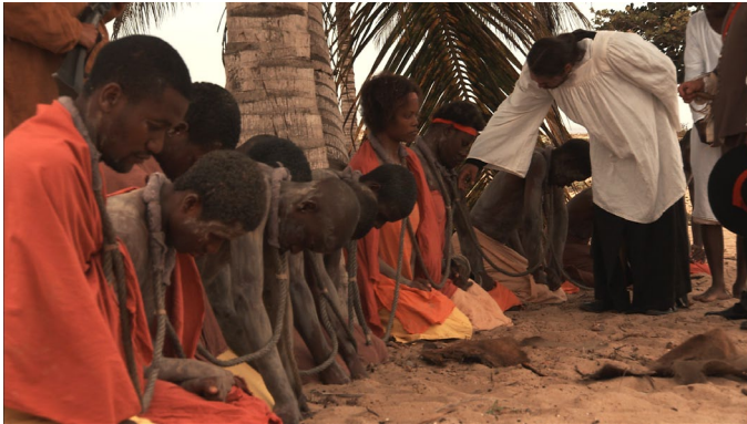
Baptism of slaves destined for America, from 1607: A Nation Takes Root. Jamestown Settlement

In August 1619, a group of West Central Africans arrived in Virginia aboard White Lion , a privateer vessel. While raiding in the Caribbean the White Lion , along with privateers on another ship, Treasurer , had seized part of a cargo of Africans from a Portuguese slave ship named Sao Jao Bautista bound from the African city of Luanda to Veracruz, Mexico. A short time later the White Lion stopped at Point Comfort, the site of modern-day Hampton, Virginia. Here at least 20 of the captured Africans were sold to officials of the Virginia Company. Treasurer arrived shortly thereafter with more Africans.