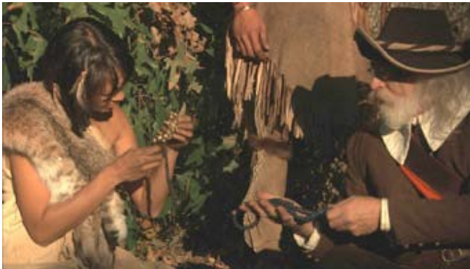
Powhatan trade with English, from 1607: A Nation Takes Root. Jamestown Settlement

Challenges continued to plague the settlers. In early January 1608, shortly after Captain Newport’s return, a devastating fire destroyed much of the fort, including the colonists’ dwellings and provisions. Once again, the colony was dependent upon the Indians for food. Ironically, John Smith became the person most likely to succeed in any personal encounters with the Indians, as he had done during the previous critical months. Smith, along with Newport, became the critical negotiator with Wahunsonacock. It was during these negotiations that thirteen-year old Thomas Savage was presented to the chief who received him as his son. In return,