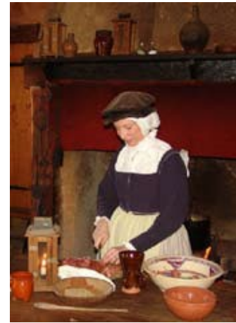
Cooking in re-created James fort, Jamestown Settlement

In the fall of 1618, it was reported that the City of London was shipping 100 boys and girls to Virginia. These children were destitute, supported by London parishes, and the relocation seemed an ideal arrangement for all parties concerned. Even though many of the children did not want to go, it was deemed best for them because they were being rescued from the streets and given an opportunity to learn some good crafts or trades. Around 250 destitute children were transported between 1617 and 1623 to the Virginia colony. Because there is only an occasional reference to children at Jamestown, very little is known about their daily lives.