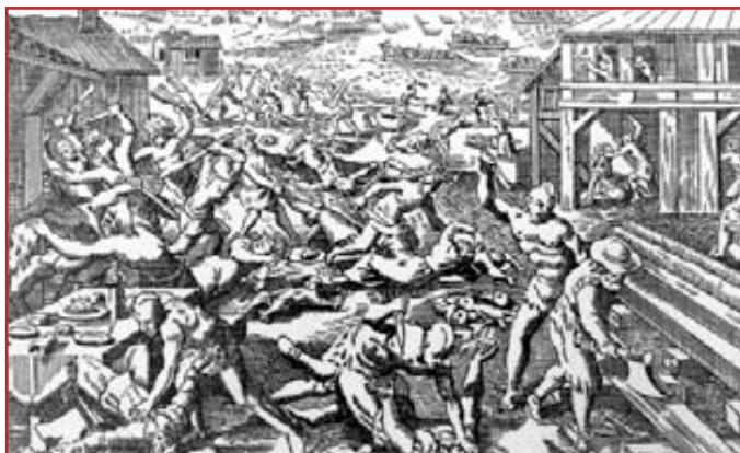
1622 Indian uprising, Theodor de Bry

1677 Treaty of Middle Plantation the Indians acknowledged they were subjects of the King of England.