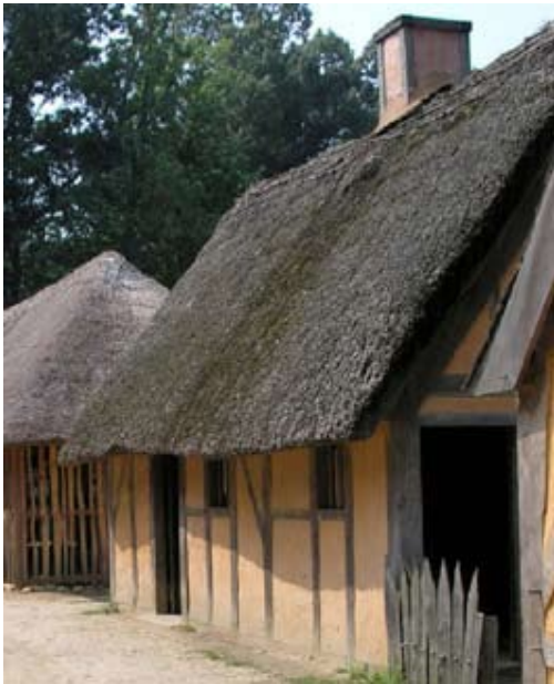
English housing inside re-created James fort, Jamestown Settlement

A week after the building of the second fort, Captain Newport sailed for England and the realities of life in the wilderness set in as colonists experienced a variety of challenges including hunger and disease, each of which took a heavy toll. The colonists were so weakened from sickness it was reported they could hardly stand. George Percy wrote that most died from famine, but the major killer was more likely polluted river water, full of “slime and filth,” which led to salt poisoning, dysentery and typhoid. An epidemic swept the settlement and left half the 104 men and boys dead before the end of September. Only about 50 survived as winter approached. The colony was on the brink of collapse. With Captain Newport gone and Captain Gosnold having died, the leadership disintegrated, and the men began quarreling among themselves. It was around this time that the Powhatan, rather than resuming hostilities against the weakened, disease-ridden Englishmen, instead brought food to the fort and saved the colonists’ lives.