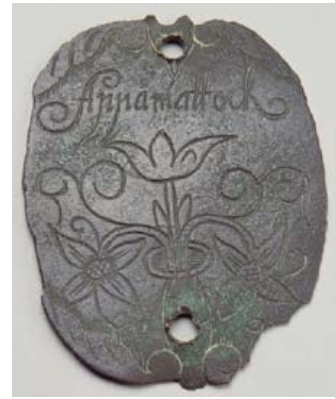
Copper Indian badge, 1662

Historical background materials made possible by Archibald Andrews Marks.