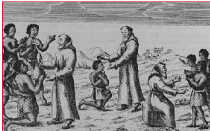
Portuguese priest baptizing Africans, Fortunato da Alemardini

These first Africans could have been from an urban area and may have been familiar with European languages, trade items, clothing