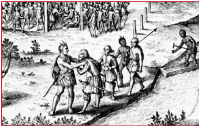
Engraved by Theodor de Bry

Englishmen were very aware of the importance of women and families in the success of Jamestown. In 1619, while receiving grants of land from the Virginia Company as dividends for their time in Virginia, the male