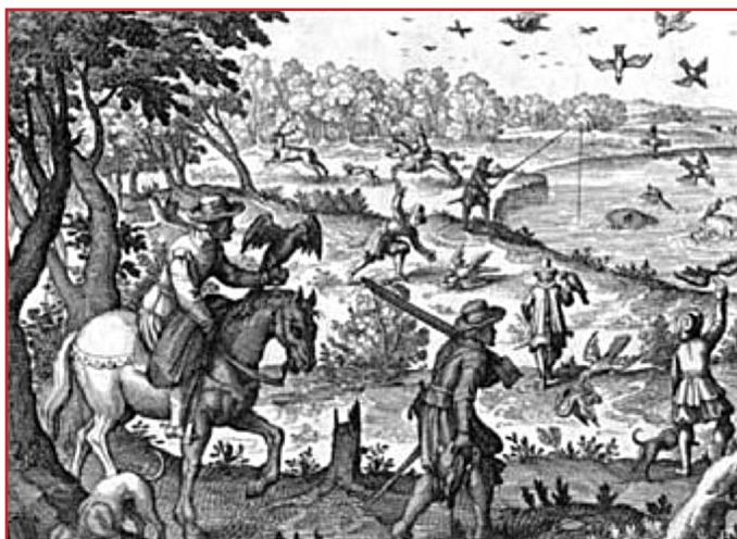
Employments of Englishmen, Theodor de Bry

have to buy these from other countries. At the same time, colonies could be markets for England's manufactured goods. England knew that establishing colonies was an expensive and risky business. The organization of business ventures by merchants, blessed by the crown, served both the economic and political interests of the country.