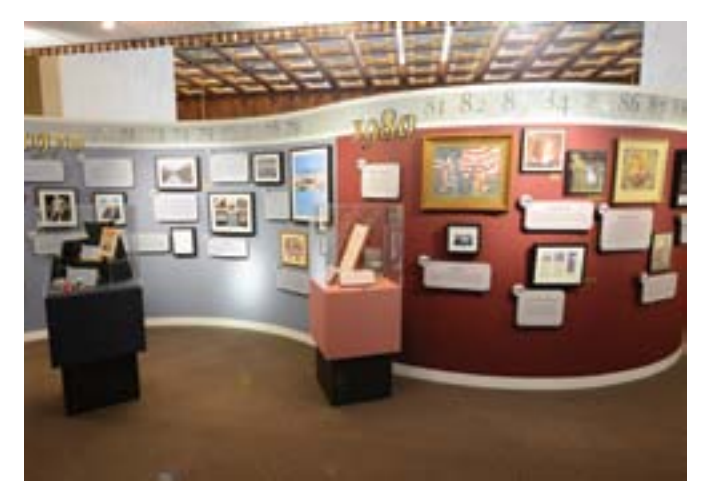
West Virginia 150 exhibit - Culture Center

We also hope you will join in the many celebrations in 2013 that will salute these achievements of yesterday. In 2013, the Museums Section and the West Virginia Division of Culture and History will host special museum days