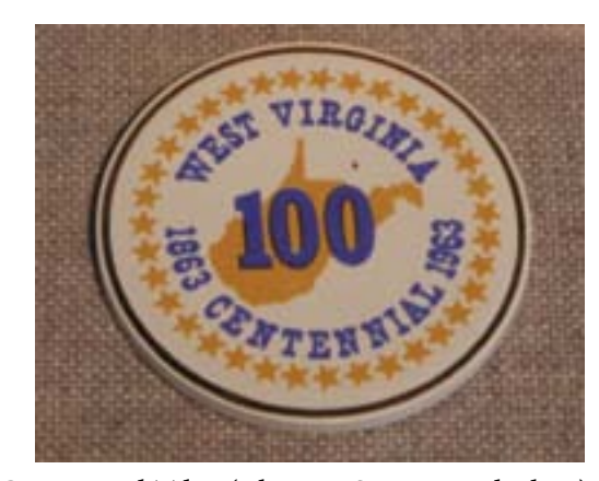
Centennial Tile